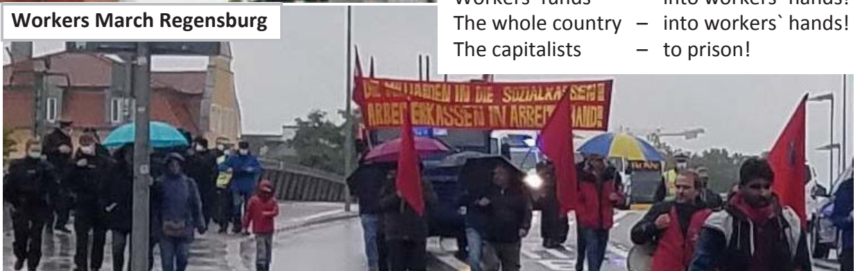
Workers March Regensburg