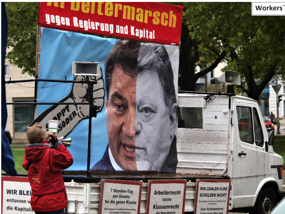
Workers' March in Munich

Workers of Daimler, BMW, VW, Continental, MAN, Deutsche Bahn and other companies, whole delegations from companies like the LSG/airport, together with the laborers from hospitals, transport companies, organizations of national minorities and especially the working, learning and fighting youth from companies, schools and in the FDJ were on the streets, in front of companies, during the warning strikes of the collective bargaining rounds, in front of the vocational schools and at the seat of the city and federal states governments.