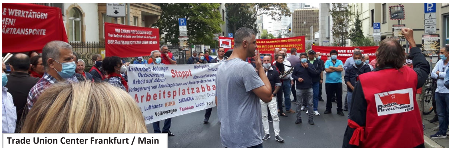
Trade Union Center Frankfurt / Main

Some workers at MAN (the MAN capital has announced 9500 layoffs) see it the same way after a protest rally of the IG Metall: „Yesterday we spoke militantly and today we go back to work. What we should have done today is go on strike“. – „Empty talk, I expected more“ – „Actually we should have been on strike for at least a week now to apply pressure“ – „Millions striking on the streets instead of millions for those up there“, they tell us in Nuremberg.