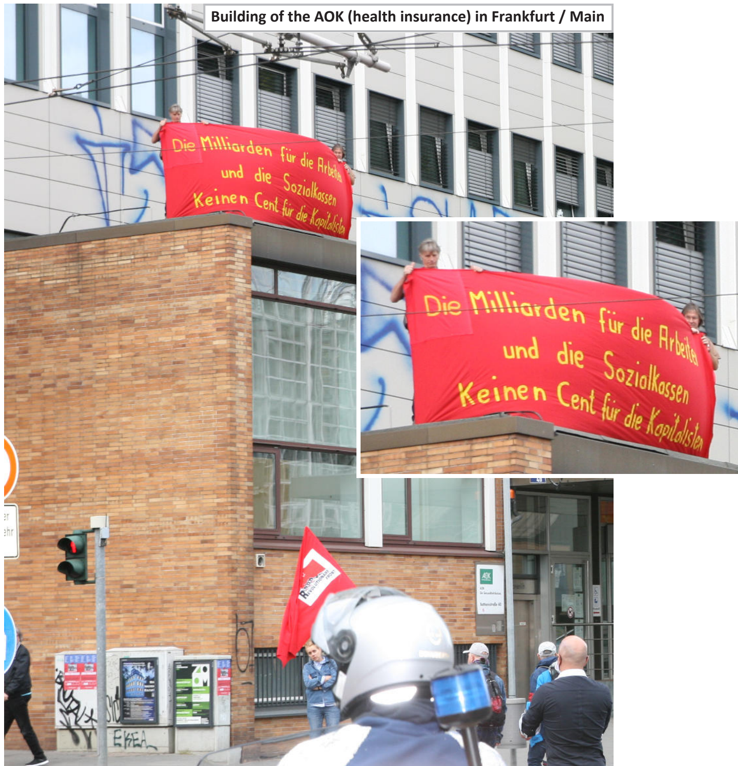
Building of the AOK (health insurance) in Frankfurt / Main

Join the Revolutionary Front, the unity of class-conscious workers and laborers across factory fences and city boundaries!