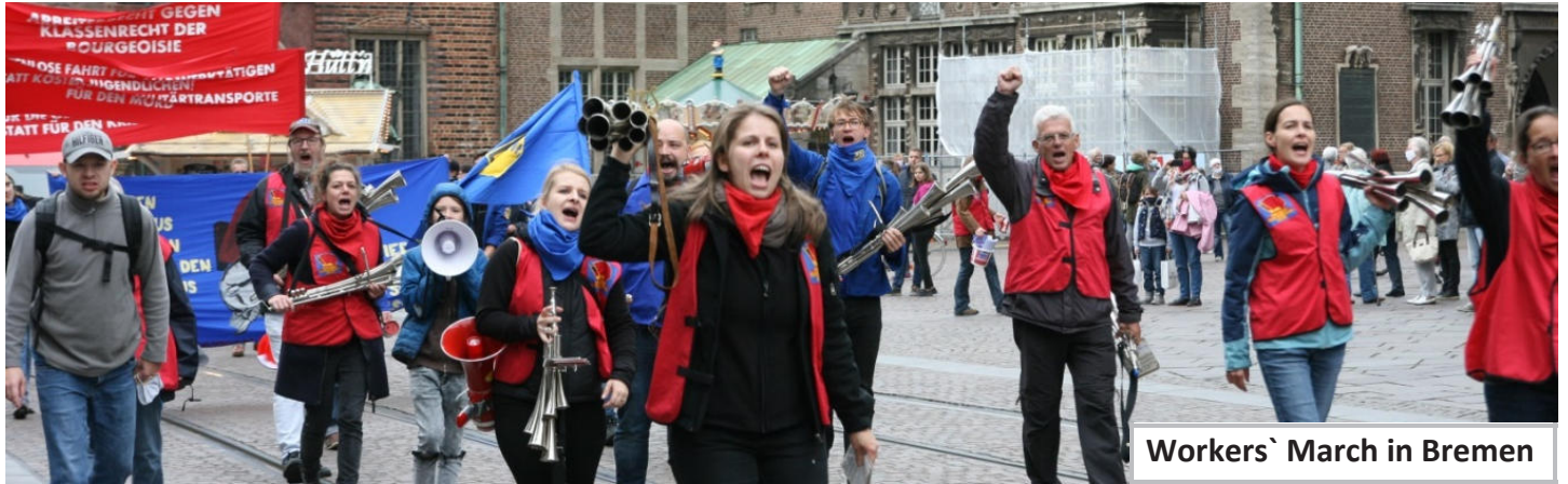
Workers' March in Bremen

There was widespread agreement with the Revolutionary Front's stance that the struggle must be fought together. Workers and laborers, of metal, electric or chemical companies, together with hospital employees, those at the airport together with the tram drivers. Young and old, no matter which passport, no matter if temporary worker or permanently employed. The workers' marches have shown: In a common struggle, when we own the street, our slogans, our workers' songs sound, then the class is formed and gains its strength.