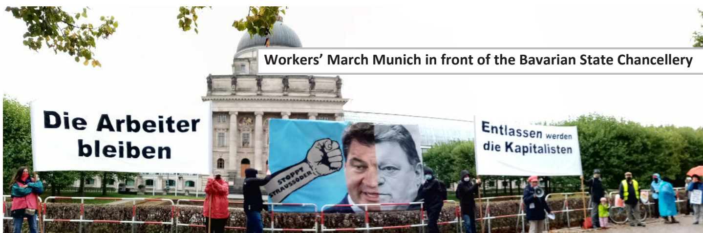
Workers' March Munich in front of the Bavarian State Chancellery

Capitalism is weak and it is up to us to finally take it off the drip. Or – as one worker from Regensburg said during the protests against the thousands of layoffs at Continental: „If you want to prevent mass layoffs with a motorcade and a human chain, it’s like protecting yourself from a downpour with a newspaper. But we do not want to protect ourselves from the rain!“