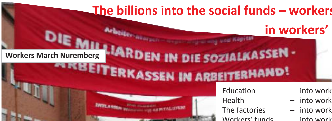
Workers March Nuremberg