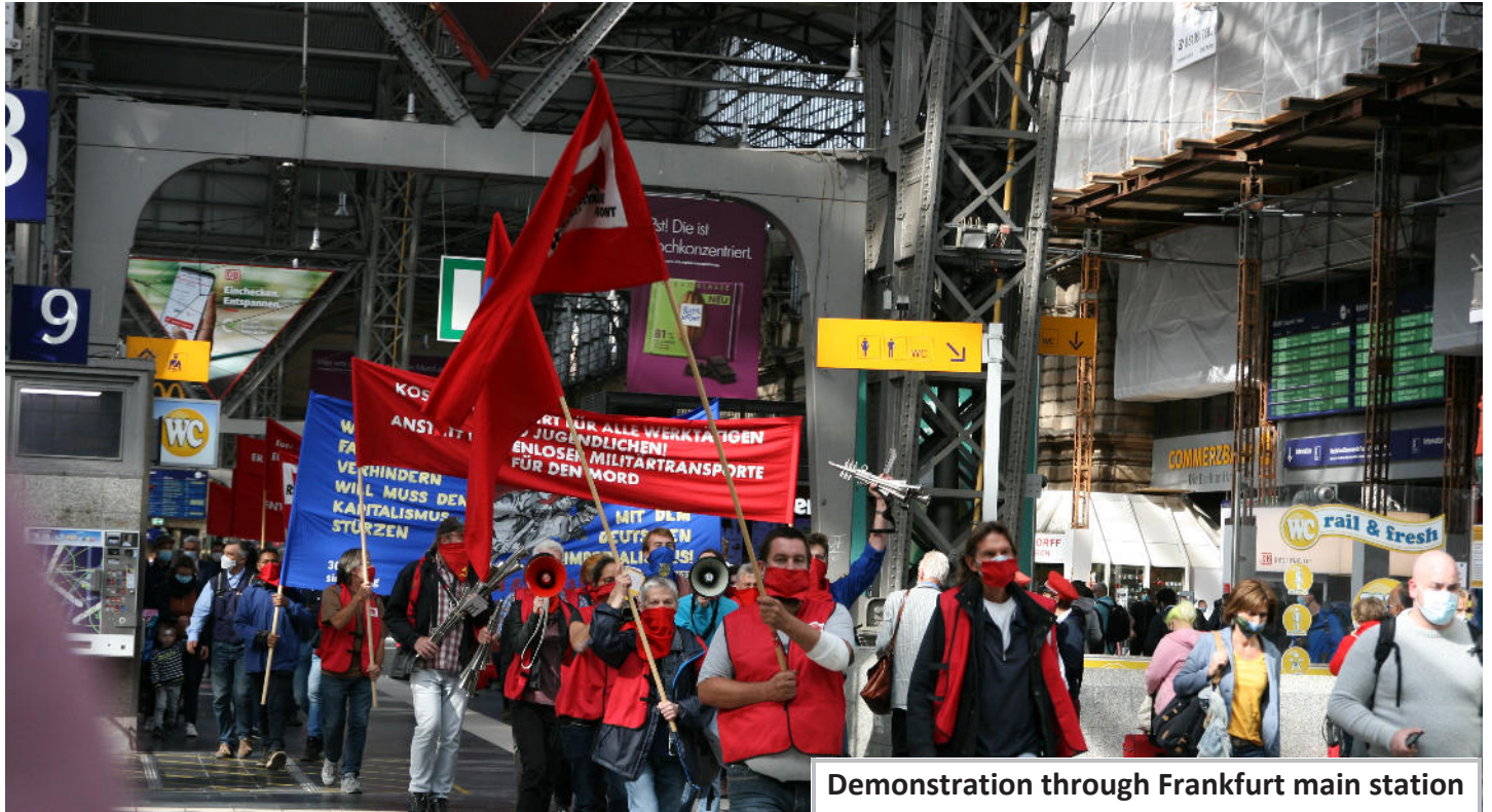
Demonstration through Frankfurt main station