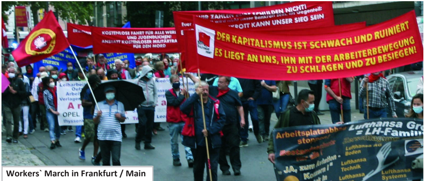
Workers' March in Frankfurt / Main

It is up to us to beat and defeat it with the workers movement!